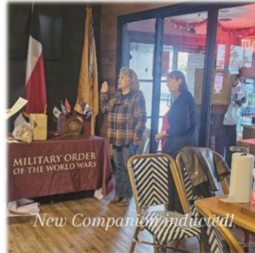
New Companies inducted!

Please send highlights of ROTC or JROTC cadet activities for the next & future newsletters!