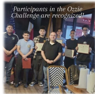
Participants in the Ozzie Challenge are recognized!