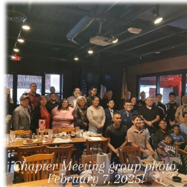
Chapter Meeting group photo, February 7, 2025!