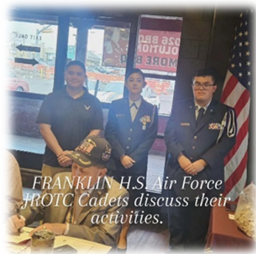
FRANKLIN H.S. Air Force JROTC Cadets discuss their activities.

In Our 2 nd Century of Serving Youth, Community and Nation